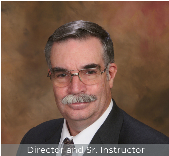
Director and Sr. Instructor

MSc Engineering Management CEM, CFM, CHFM, FMP, LEED® AP, MRICS, PROFM, SFP, VMA