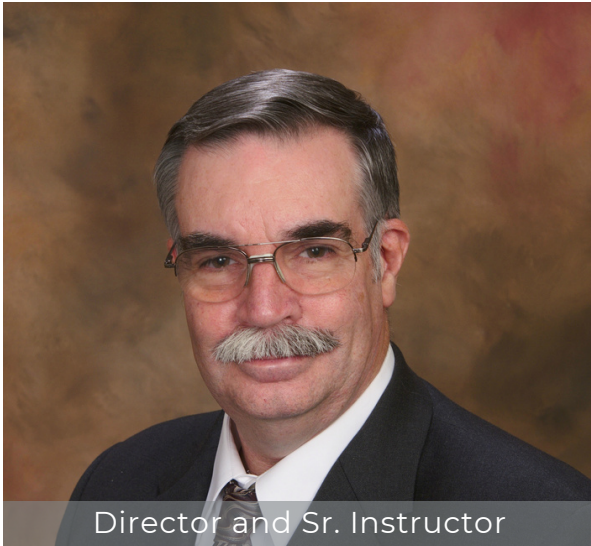
Director and Sr. Instructor

MSc Engineering Management CEM, CFM, CHFM, FMP, LEED® AP, MRICS, PROFM, SFP, VMA